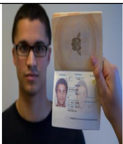
7 _____ the passport