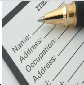
1 _____ out the form

۷. با توجه به تصاویر، کلمات مناسب را در جای خالی بنویسید (۵)