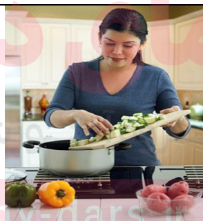
8 _____ dinner