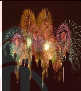
4. Watch _____