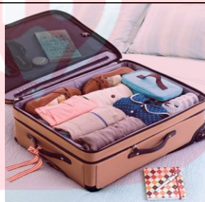
6 _____ for a trip